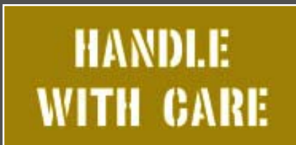
HANDLE WITH CARE

Actual image size is 4-1/4" x 10". Overall stencil dimensions are approximately 12" x 12". We can also create a stencil to your exact specs. Let us know if you have a different layout in mind or would like us to fabricate a unique stencil just for you.