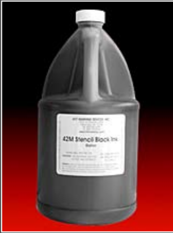
#42M Stencil Ink Gallon Bottle - BLACK

For marking and stenciling iron, steel drums, boilers, sidewalks and any painted or non-absorbent surfaces. Drying time: Will set to the touch in 5 minutes. Will dry in 10 to 15 minutes. Comes in: Black, Red, Blue, Green, White, Yellow, Orange, Brown, Silver. MIL-I-1795A, TT-I-558.