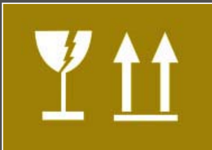
FRAGILE / UP

Actual image size is 5-1/2" x 8-3/4". Overall stencil dimensions are approximately 12" x 12". We can also create a stencil to your exact specs. Let us know if you have a different layout in mind or would like us to fabricate a unique stencil just for you.