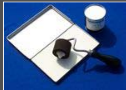
Ink Pad w/ Type P Foam/Type P Type K