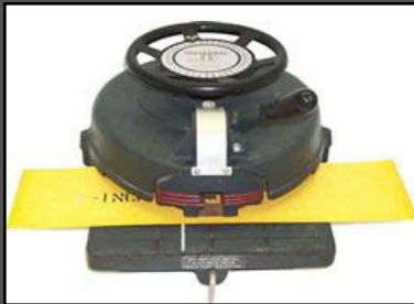
Stencil Cutting Machines

Stencil Cutting Machines are available in 6 character sizes, including 1/8", 1/4", 1/2", 3/4", 1" and 2". All Universal stencil cutters are built to U.S. Government specifications GG-S-747. These rotary magazine stencil cutters are designed for use with standard oilboard materials. For best results use .007" oilboard with the 1/8" machine and .010" or .015" oilboard with 1/4" and larger machines.