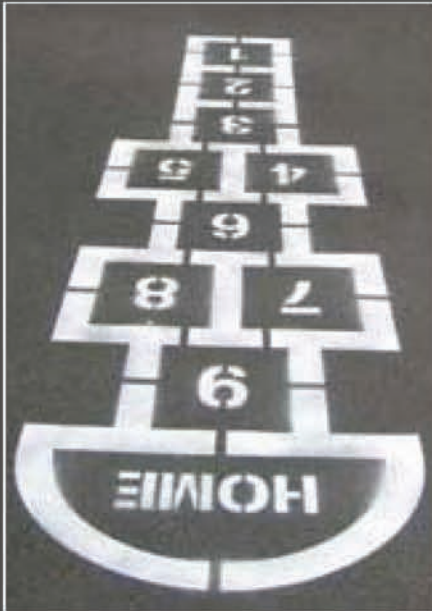
HOPSCOTCH - 51 in. x 120 in.