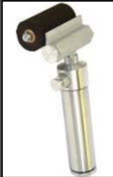
Press Button Fountain Roller Unit