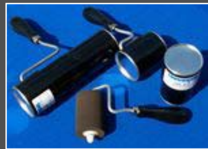
Roller Unit w/ Cover