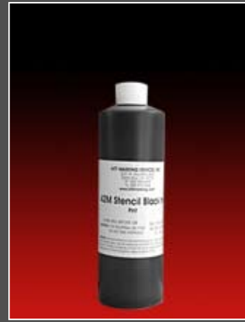
#42M Stencil Ink Pint Bottle - BLACK