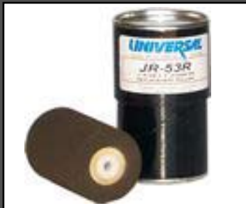
Replacement Roller in Box