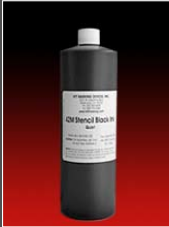
#42M Stencil Ink Quart Bottle - BLACK