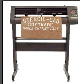
SCM-5E Electronic Stencil Cutting Machines

SCM-5E Electronic Stencil Cutting Machines will cut character sizes from 1/4" tall and up. The Stencil CAD software supplied contains a standard stencil character font with both upper and lower case letters. Logo and symbol vector files can be imported and merged with text characters.