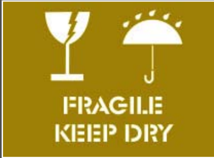
FRAGILE / KEEP DRY

Actual image size is 9-1/4" x 9". Overall stencil dimensions are approximately 12" x 12". We can also create a stencil to your exact specs. Let us know if you have a different layout in mind or would like us to fabricate a unique stencil just for you.