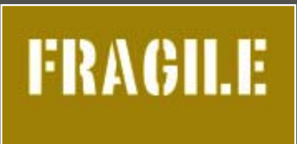
FRAGILE (text only)

Actual image size is 2-1/2" x 10". Overall stencil dimensions are approximately 12" x 12". We can also create a stencil to your exact specs. Let us know if you have a different layout in mind or would like us to fabricate a unique stencil just for you.